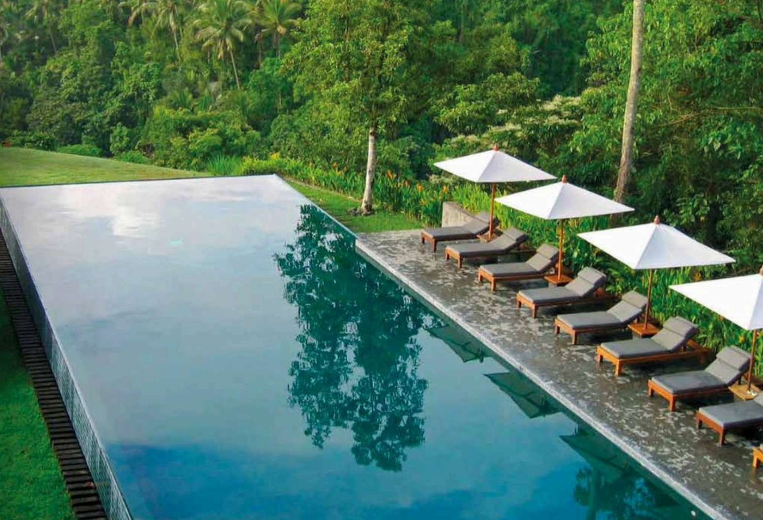
Eco-Resort in Guinea-Bissau